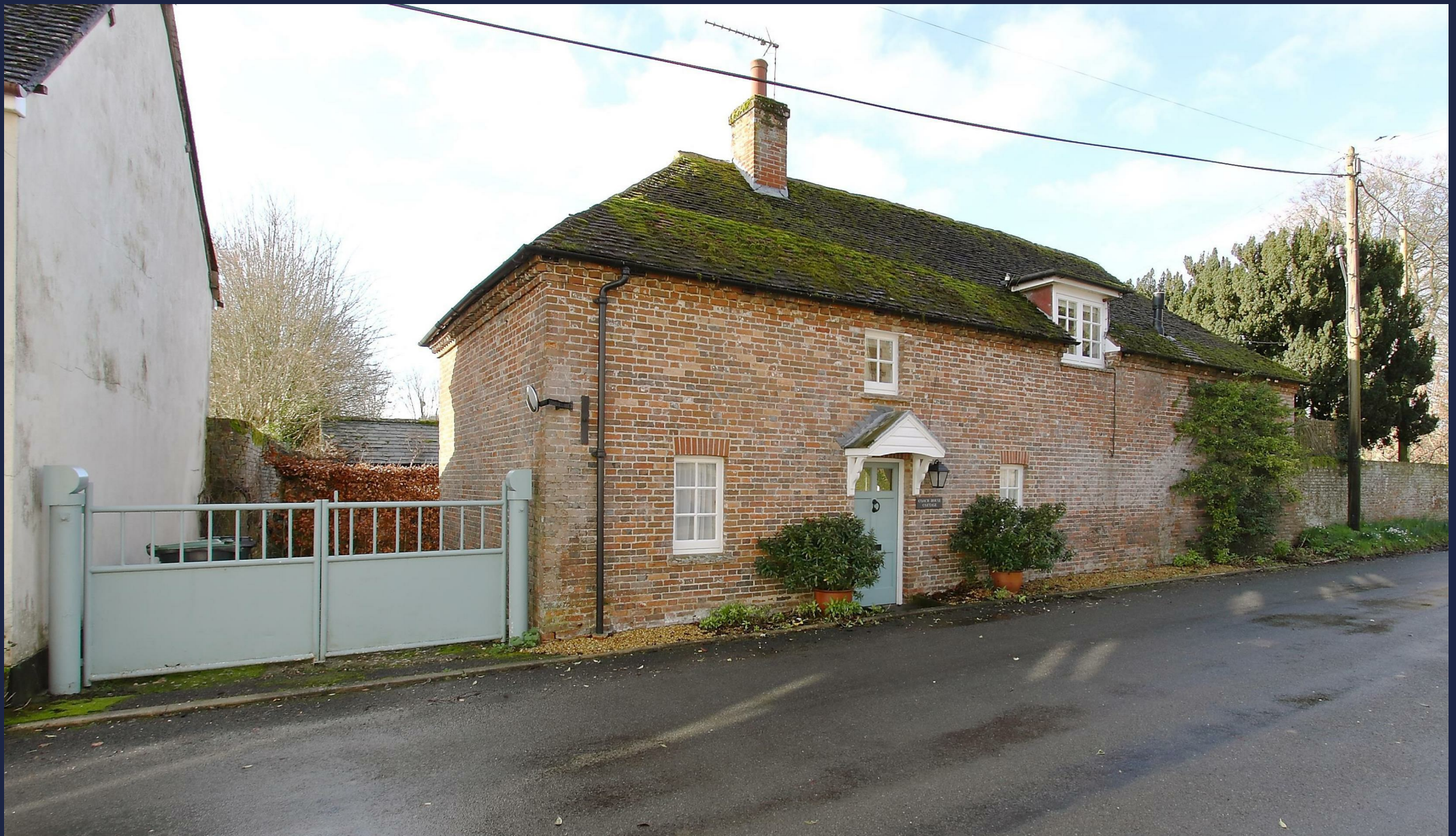
Coach House Cottage, Gussage All Saints, Wimborne